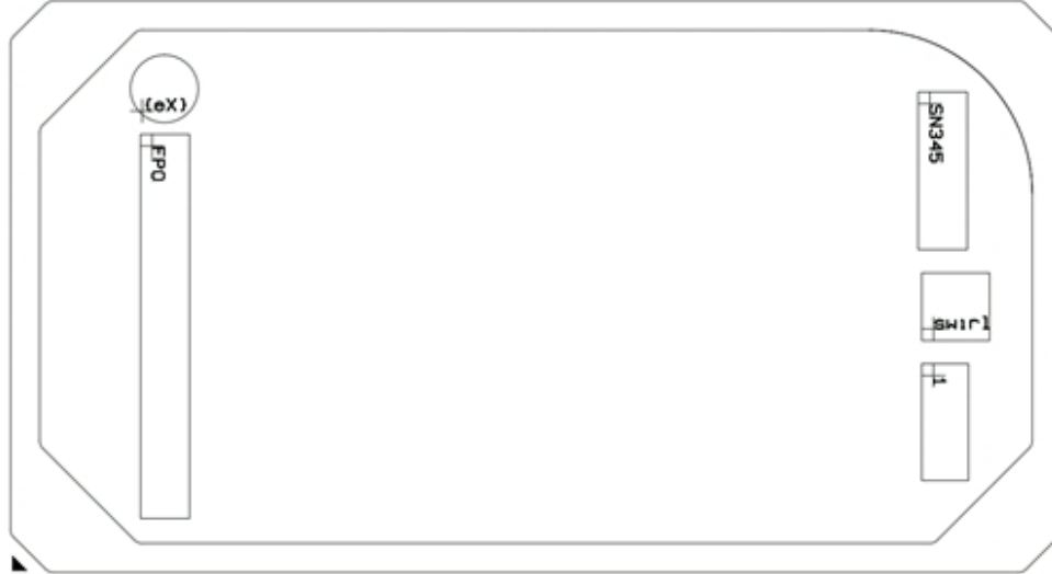
Figure 2-1. Processor Based on UP3/H35/UP3-Refresh/H35-Refresh Processor Line Multi-Chip Package BGA Top-Side Markings

Pin Count: 1449 Package Size: 45.5 mm x 25 mm