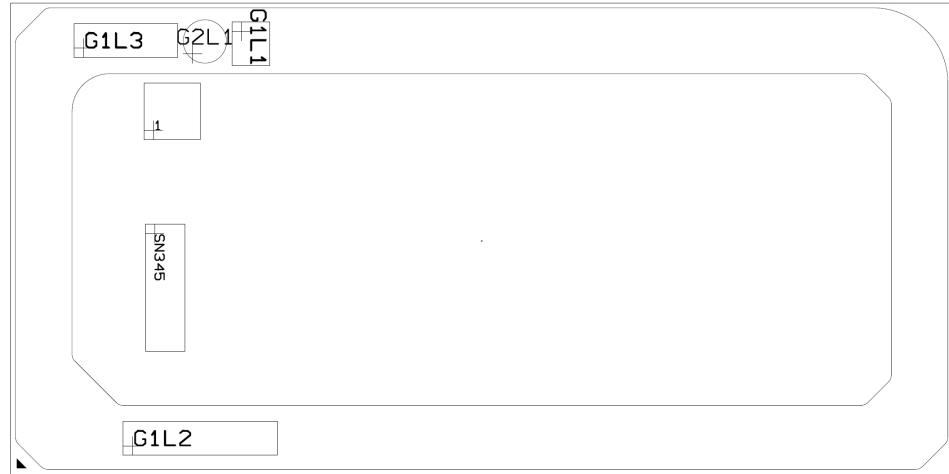
Figure 2-2. Processor Based on H/P-Processor Line Chip Package LGA Top-Side Markings

Pin Count: 1744 Package Size (width x height): 50mm x 25mm